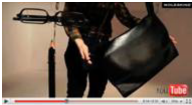
General new collections

Check out the three new videos featuring the new collections: